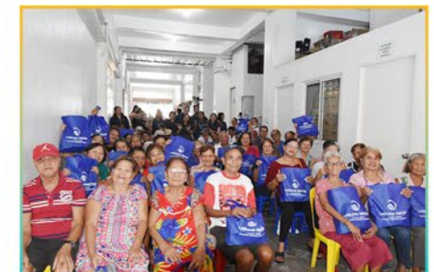
Brgy. Niugan Senior Citizens Association, Cabuyao City