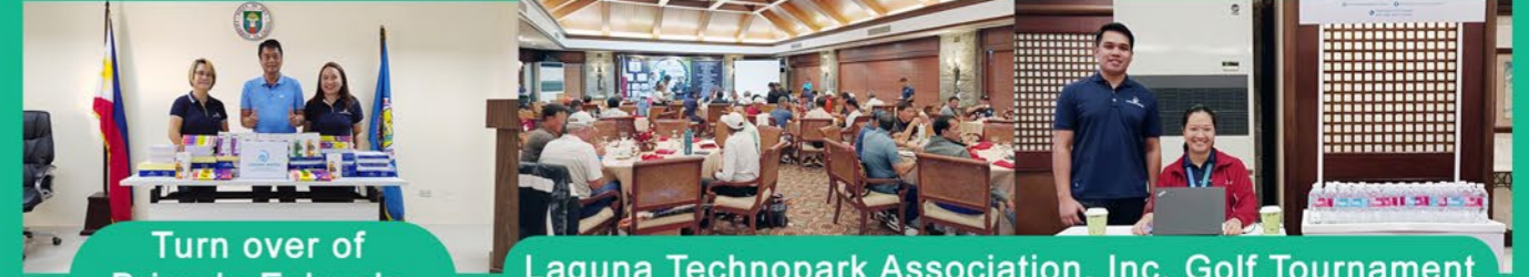
Turn over of Brigada Eskwela donations to Pila October 23, 2024