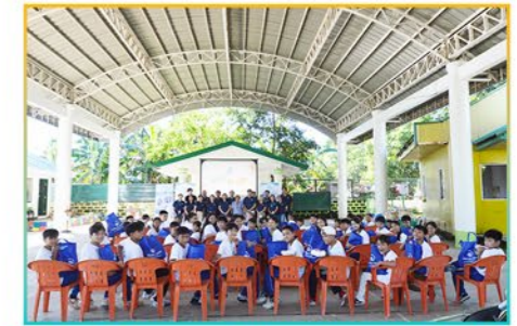
Mario Lanuza Elementary School, Municipality of Pagsanjan