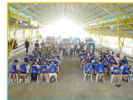
Kabulusan Elementary School, Municipality of Pakil