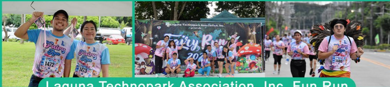
Laguna Technopark Association, Inc. Fun Run September 29, 2024