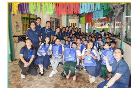
Labas Elementary School, Sta. Rosa City