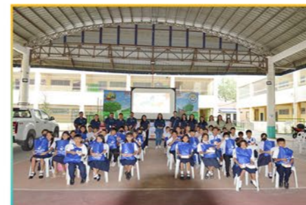
Southville 5A Elementary School, Biñan City