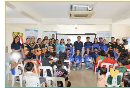
Bahay Pag-asa, Biñan City

A total of 268.5 volunteer hours were also generated from the seven sessions of Daloy ng Saya conducted from December 4 to 13, 2024 and was participated by 67 employees. In addition, partners Cabuyao City Environment and Natural Resources Office, Forever Glow, Green Cross, and Rotary Club of Alaminos Downtown also extended food and product donations for the success of the program.