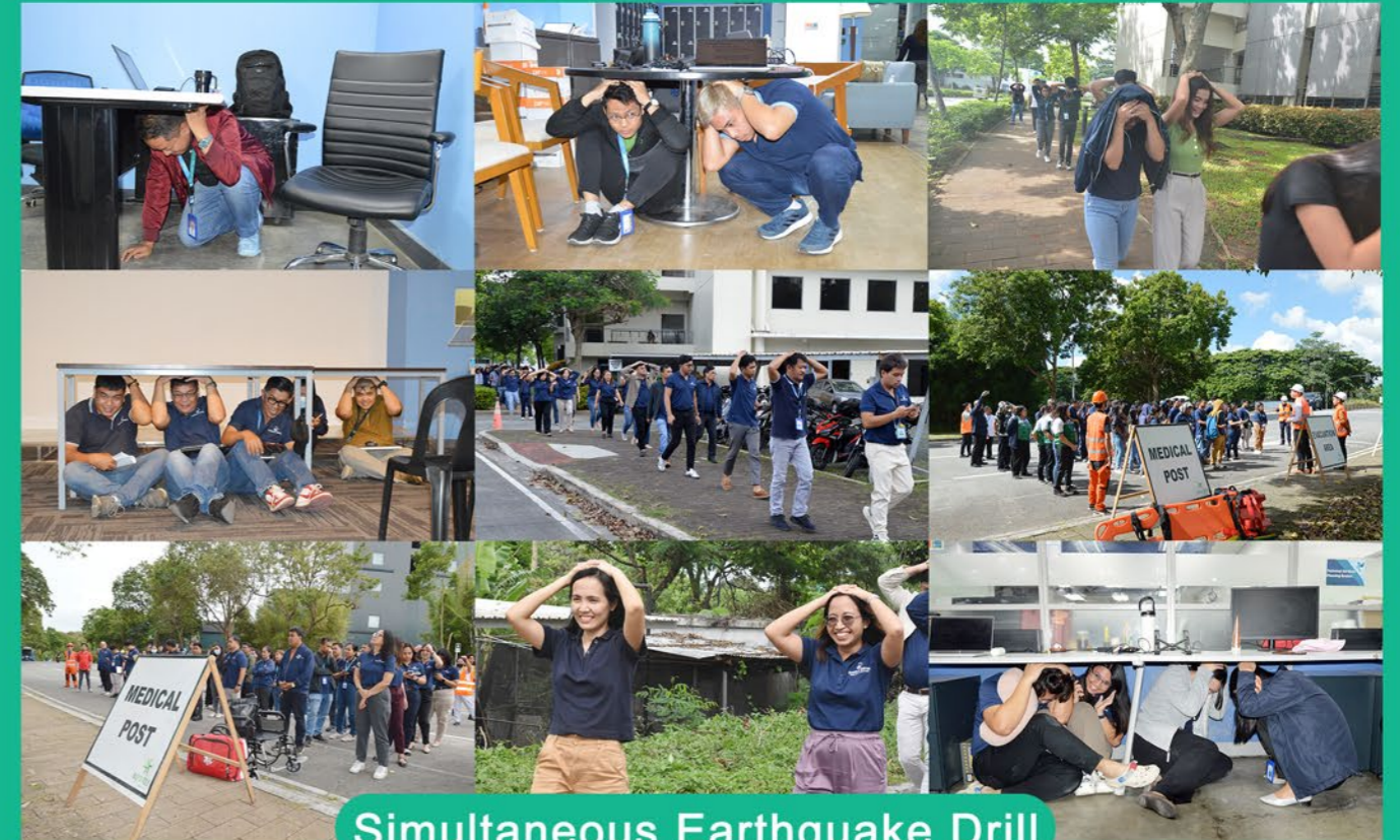
Simultaneous Earthquake Drill Quarterly of 2024