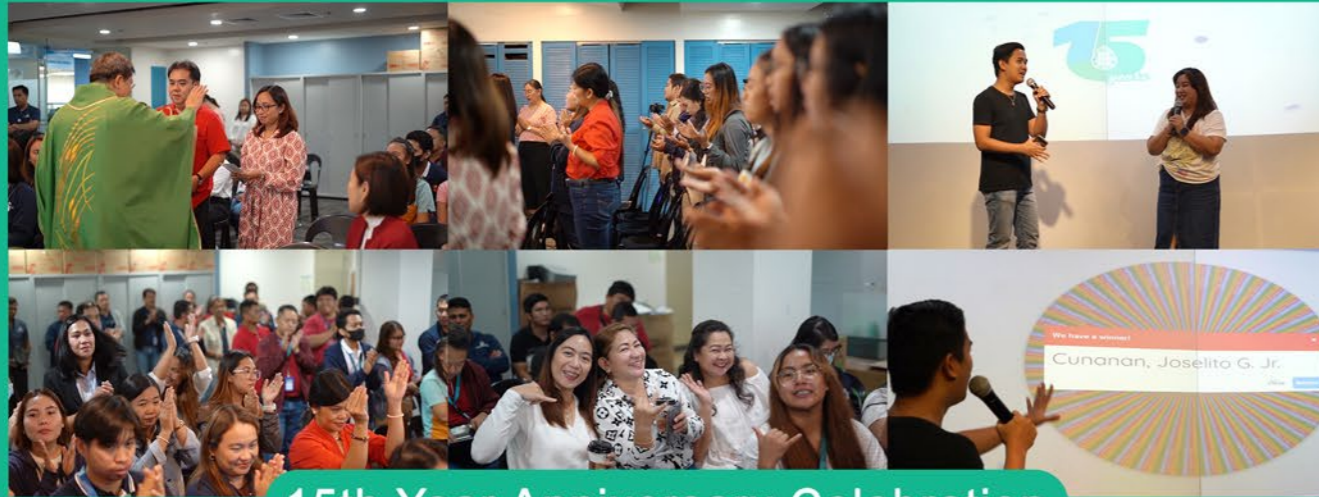
15th Year Anniversary Celebration September 22, 2024