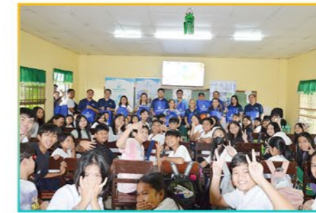
San Andres Elementary School, Municipality of Alaminos