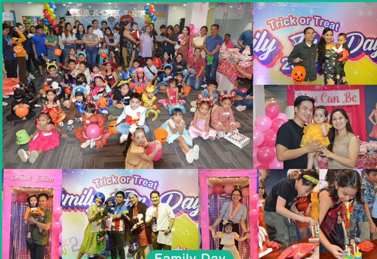
Family Day November 08, 2024